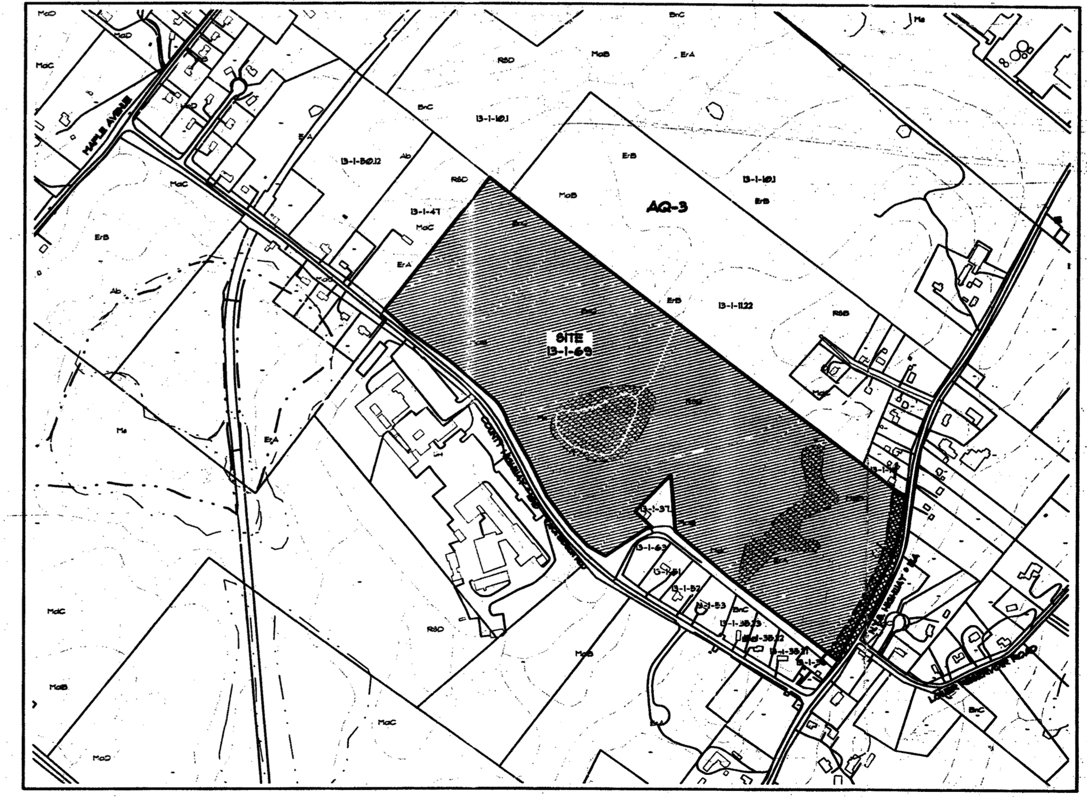
SITE CONTEXT MAP LEGEND